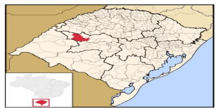
Source: https://pt.wikipedia.org/wiki/Santiago_(Rio_Grande_do_Sul), location.

Regarding the municipality, the Colégio Politécnico da UFSM (2015) studied, as well as other authors, family farming in Santiago and relations with public policies, as it has a favorable history, which is perpetuated by many municipal administrations, promoting the segment under analysis. The structure built of the market garden called Ênio Kinzel is representative, a commercial structure that facilitates the arrival of products from the municipal family agriculture, allowing the access of final consumers to fruits, vegetables, pork and sheep meat, fish, sausages, cheeses , breads, cookies, cakes, cuckas, pastries, sweets, as well as other products, in addition to three more street markets, in other locations in the city, on alternate days.