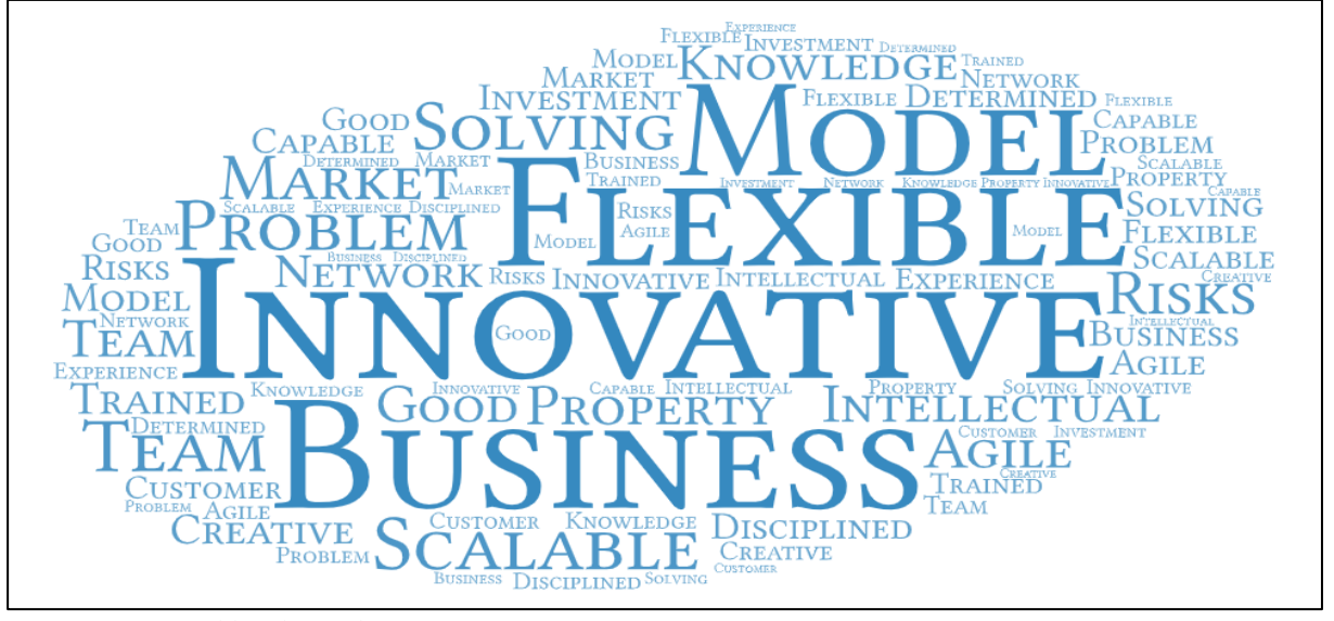
Figure 2 Word cloud of the main characteristics of a startup

In the perception of the surveyed entrepreneurs, the main characteristics of a startup were also investigated and, due to the variety of terms presented, the word cloud was created with the indicated terms, as shown in Figure 2.